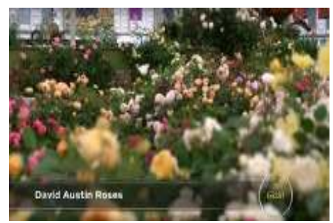
David Austin Roses – Gold Winner.