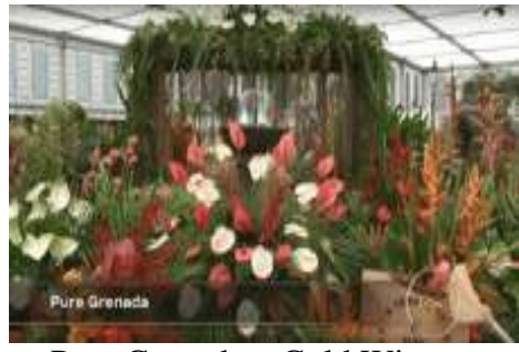
Pure Grenada – Gold Winner.