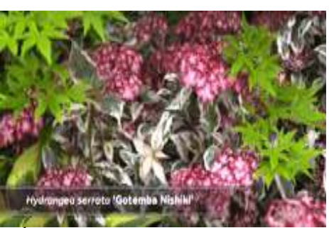
2<sup>nd</sup> winner – Hydrangea serrata 'Gotemba Nishiki'