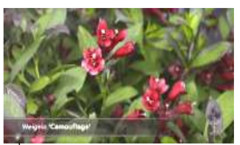
3<sup>rd</sup> winner, Weigela 'Camourflage'

At the Chelsea Flower Show in England, the Royal Horticultural Society Plant of Year was announced. For the judging process the judges looked at access for innovation, impact and appeal.