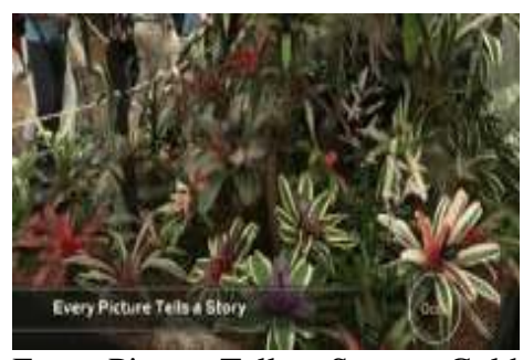
Every Picture Tells a Story – Gold Winner.