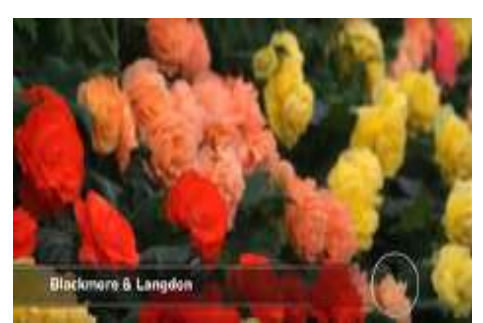
Blackmore & Langdon – Gold Winner.