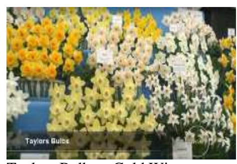
Taylors Bulbs – Gold Winner.