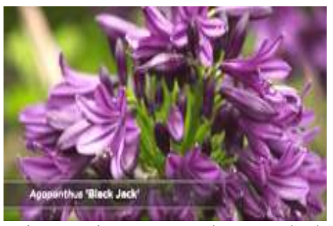
Winner is Agapanthus 'Black Jack'. A new variety bred in South Africa, repeat flowering for 3 months.