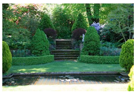
ARD RUDAH - 49 Devonshire Lane, Mount Macedon 3441.

Open Saturday 4 November and Sunday 5 November 2017. 10.00am - 4.30pm. Entry price $10 (U18 free). Students $5.