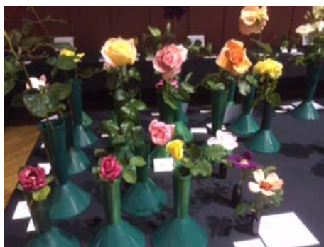
Part of the Novice Rose Section