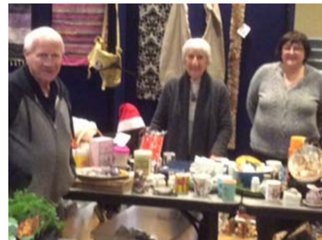
Come Buy My Wares