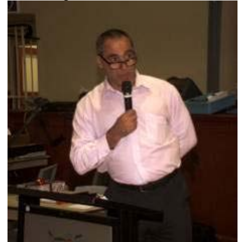
Darebin Mayor, Cr Vince Fontana