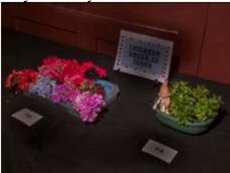
Children Under 12 – Novelty Garden. Exhibitor Alice Kainz