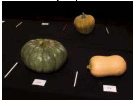
Vegetables – One Pumpkin