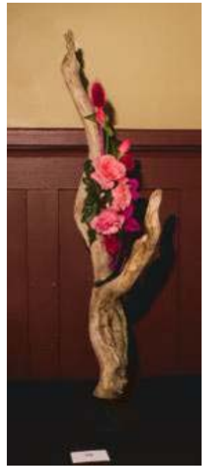
Floral Art – Flowers, Foliage and Weathered Wood