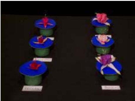
Cut Flowers – Fuchsia Blooms