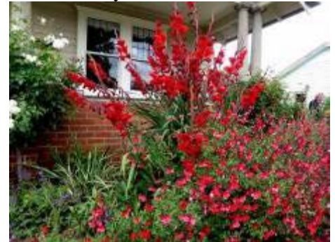
Winter Gladioli – Ainslie