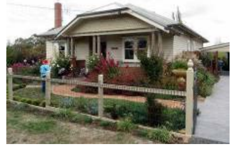
Ainslie – Kyneton