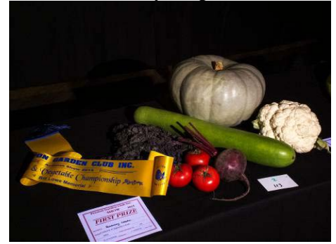
Best Exhibit Vegetable Section - Rose Celestin