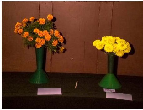
Cut flowers - Marigolds