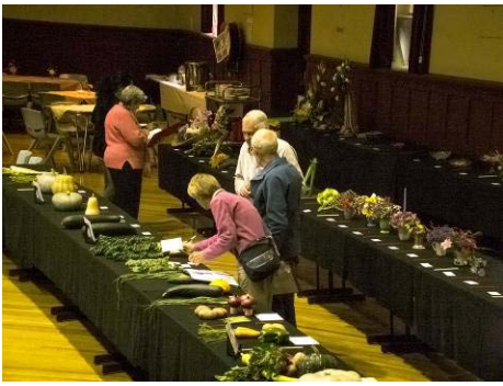
Judging of Vegetables