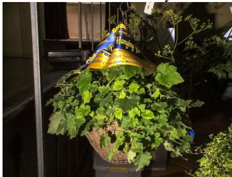
Best Exhibit Hanging Basket - Pat Kilpatrick