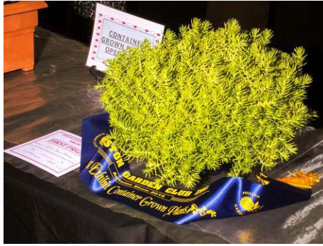
Best Exhibit Container Grown Plants - Gavin and Cheryl Warner