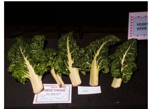
One Bunch of Silver Beet - Gavin and Cheryl Warner