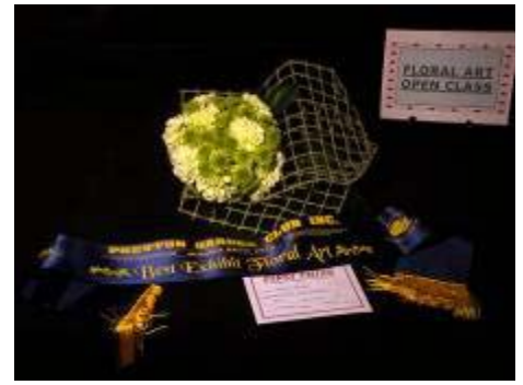
Best Exhibit Floral Art Section - Jenny Peiper