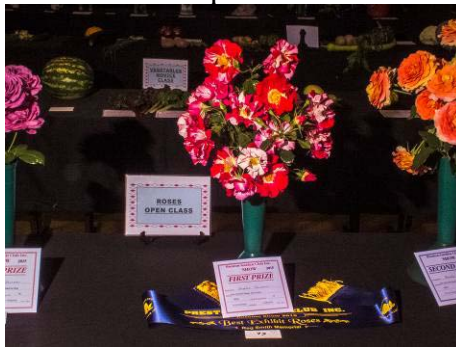
Best Exhibit of Roses - Rosalie Parsons